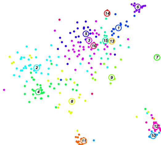
Final Clusters (tSNE)